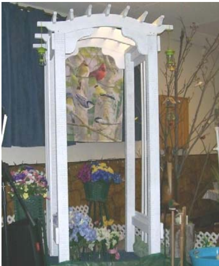
This beautiful arbour was erected on the stage and surrounded by flowers as if in a garden.

Guests reported that they had thoroughly enjoyed the evening and the challenge for the Friends is to top this next year.