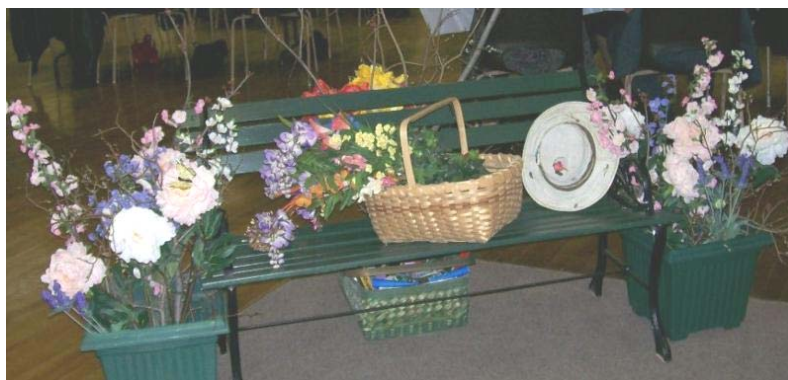
This bench welcomed guests as they entered the hall.