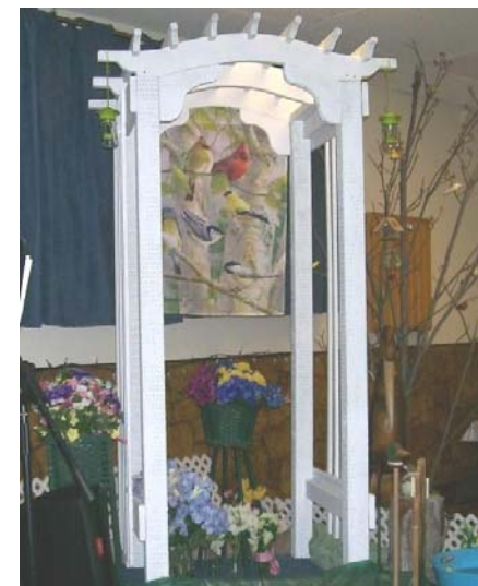
This beautiful arbour was erected on the stage and surrounded by flowers as if in a garden.

Guests reported that they had thoroughly enjoyed the evening and the challenge for the Friends is to top this next year.