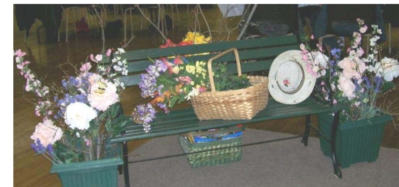
This bench welcomed guests as they entered the hall.