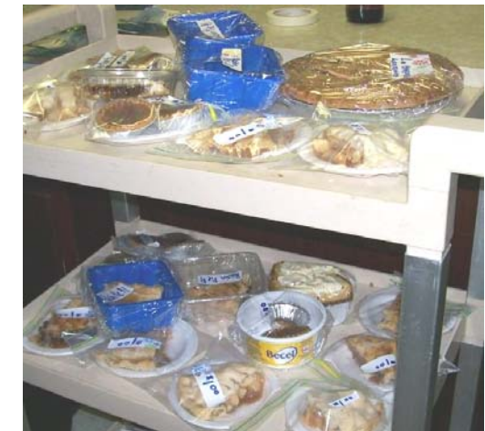
Leftover food was packaged, refrigerated and then sold at the end of the evening.