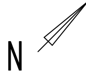
EXHIBIT HALL "C"